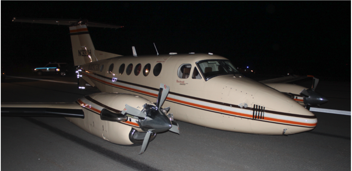
Figure 2 – View of the right side of the airplane on the runway.

A National Transportation Safety Board (NTSB) air safety investigator responded to the accident site, arriving about 1 hour after the accident. During a post-accident on scene inspection of the accident airplane, the landing gear selector was found in the down position.