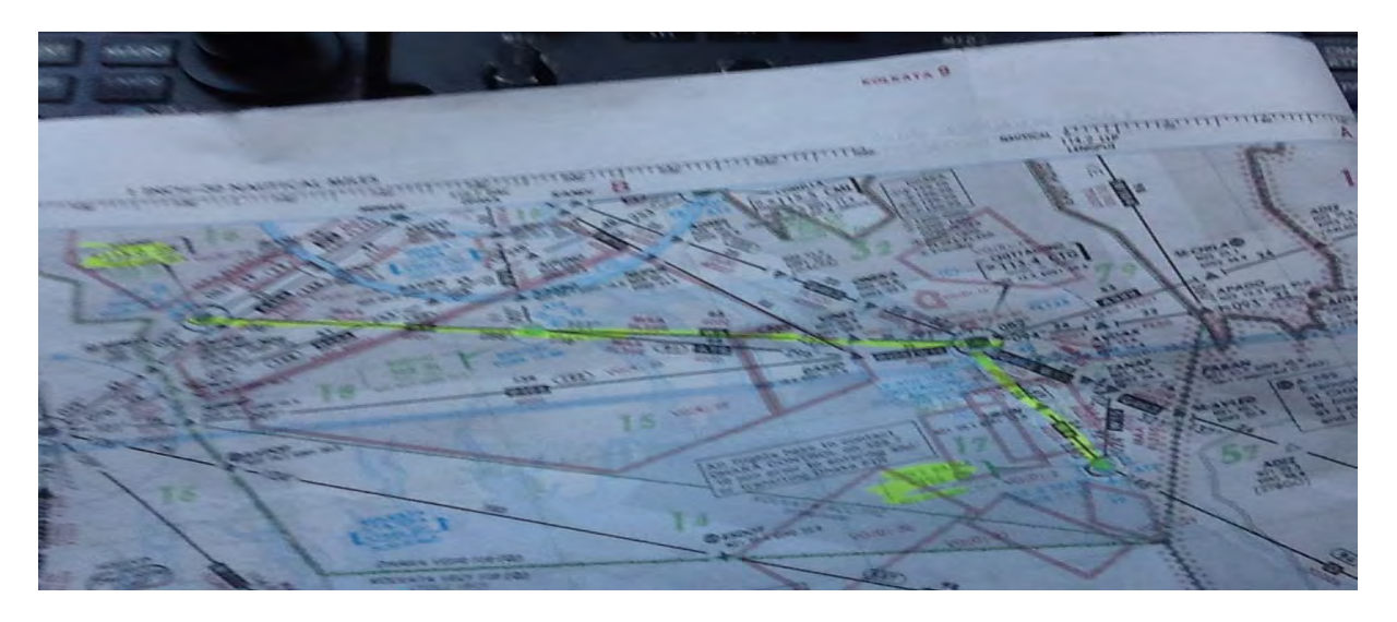
Figure 1: The ill-fated aircraft's proposed route

On March 9, 2016 one AN -26B aircraft belonging to True Aviation Ltd was operating a schedule cargo flight from a small domestic airport (Cox's Bazar-VGCB) in southern Bangladesh to another domestic airport (Jessore -VGJR) in western Bangladesh, The cargo was Shrimp fries. As per the General Declaration the total cargo quantity was 802 boxes weighing 4800 kg. The airline had filled a flight plan keeping the ETD blank. The flight plan routing was CB W4 CTG W5 JSR at FL 100. All the documents except the load sheet were found properly signed and are in the possession of AAIT.