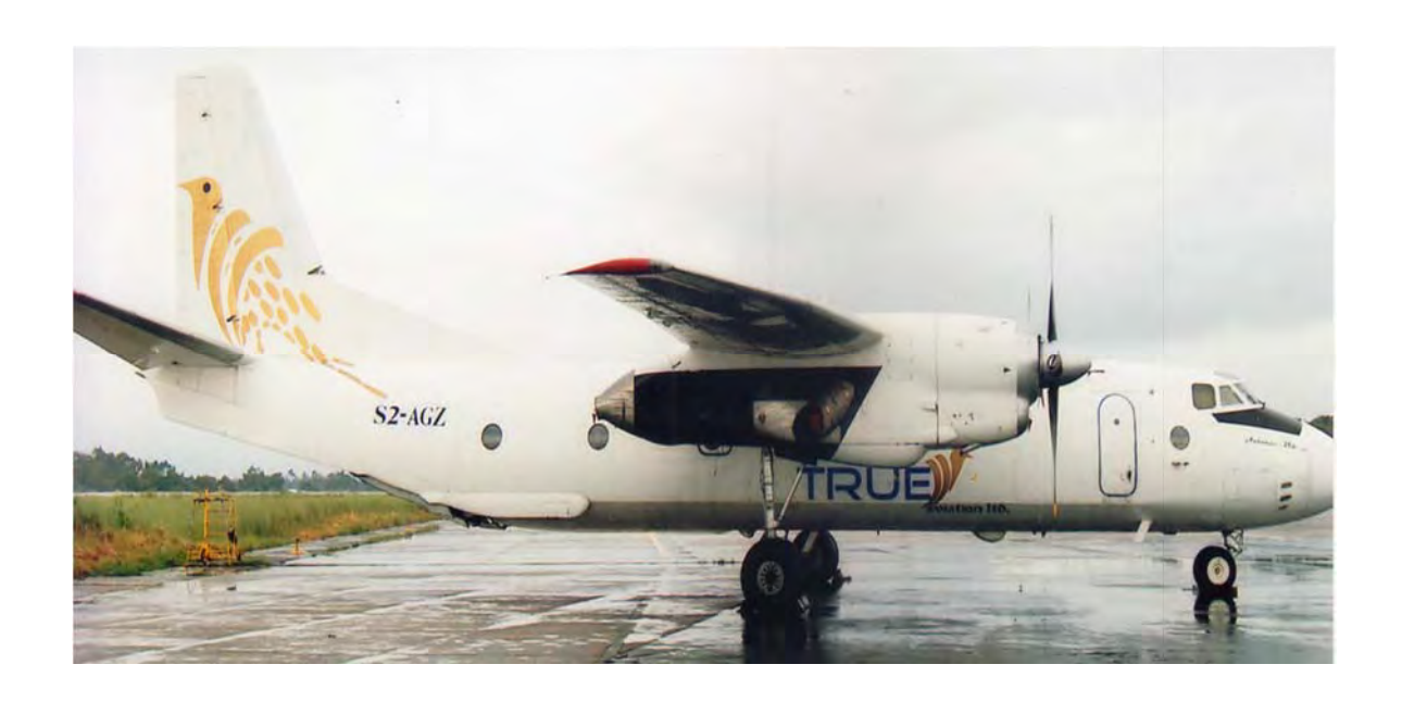
AN-26B Aircraft of True Aviation Ltd.