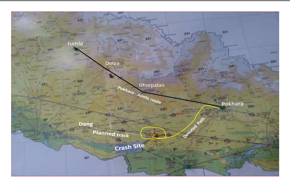
Fig 1: Flight Path and crash site