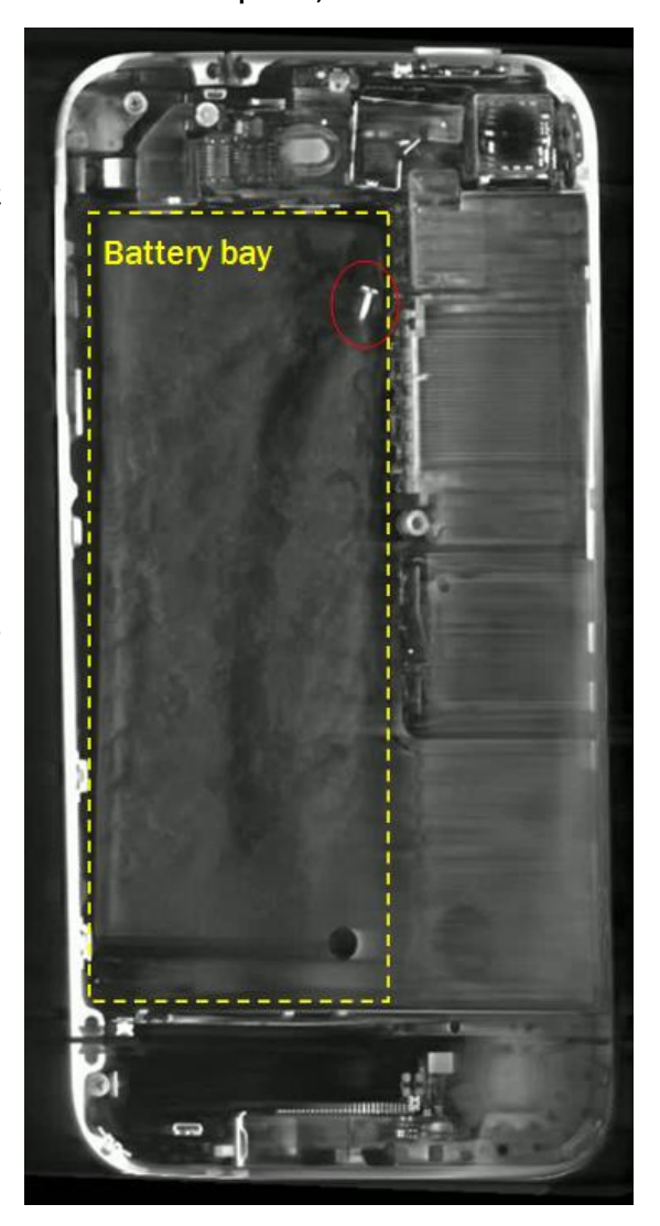
Figure 4: CT scan image of entire mobile telephone, screw circled

The completed examination concluded that the mobile telephone battery failure was most likely the result of the following sequence of events: