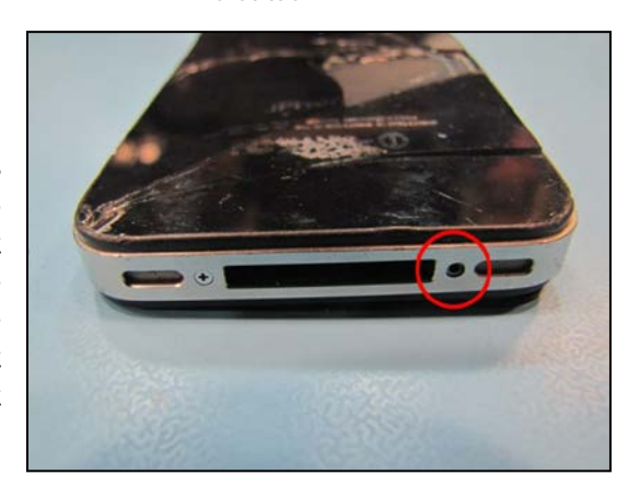
Figure 2: Image of 30-pin connector with location from which a screw was missing indicated

Preliminary x-rays performed on the mobile telephone revealed an isolated screw located in the battery section – away from any apparent fixtures associated with the telephone's construction (Figure 3).