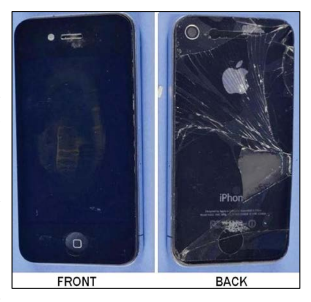
Figure 1: Incident mobile telephone