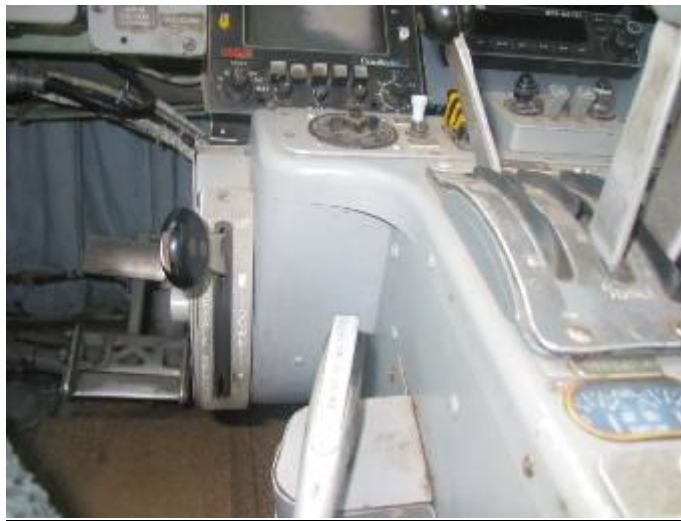
The HS 748 Landing Gear Selector in the UP position