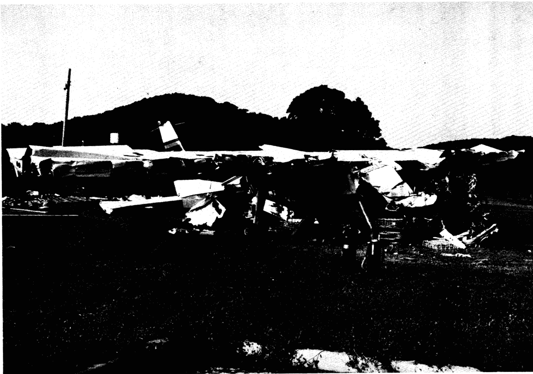
Figure 2.--Britten-Norman BN-2A-6 Islander N589A.